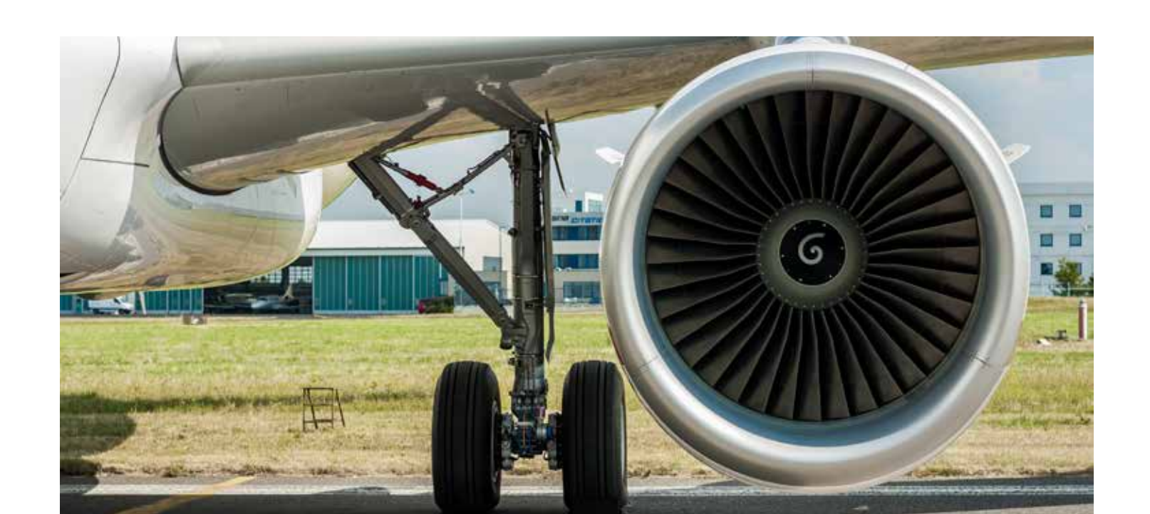
Full list of approvals is available on request. Not all products are available in every region.