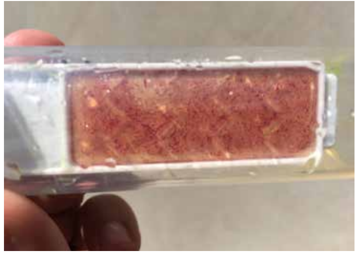
Dip slide showing bacterial contamination.

This particular glass plant manufactures and supplies the automotive glass for the rear window of a popular pickup truck. Chemetall was already providing glass grinding coolants and interleaving technology, so Chemetall was on-site when the customer began experiencing bacterial contamination in one of the automatic glass washers in their glass manufacturing process line.