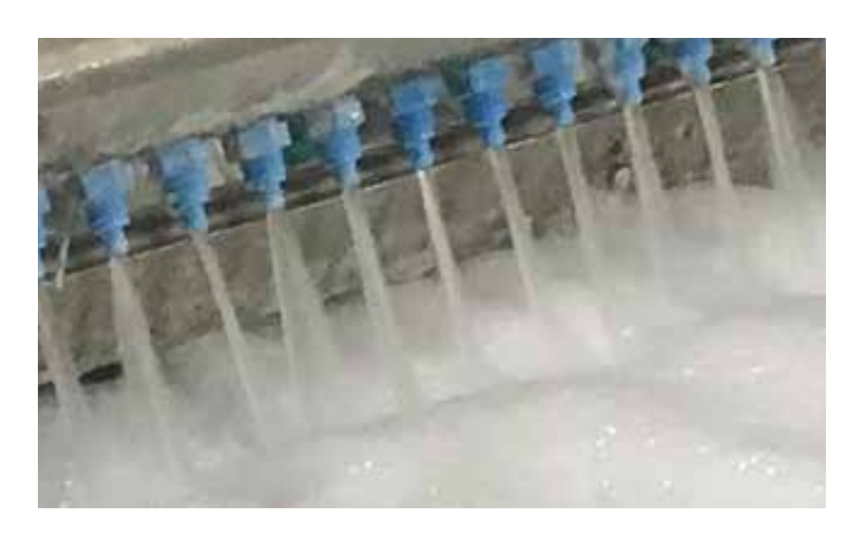
Nozzles flowing freely.

Further, the customer is extremely pleased, because not only was this specific issue resolved, but the glass is now even cleaner. There is even less clogging of the filters on the washers, resulting in a 50% reduction in the labor required to purchase and change filters. This has led to significant cost-savings.