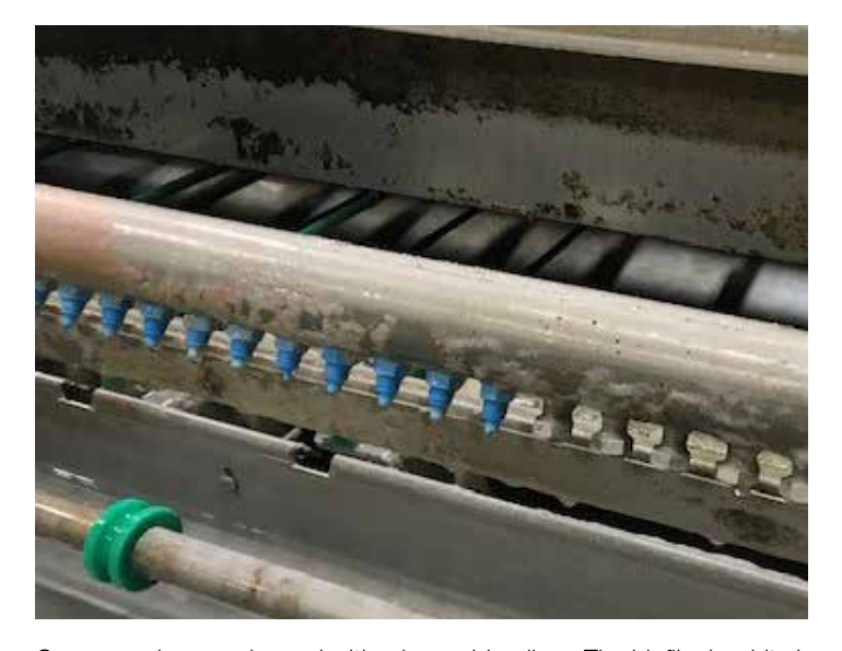
Spray nozzles are plugged with a heavy bio-slime. The biofilm is white in color and can be seen in the photo above the nozzles.

Chemetall is the Surface Treatment global business unit of the Coatings division of BASF, a leading supplier of applied surface treatments for metal, plastic, and glass substrates in a vast range of industries and end markets. Chemetall innovates, develops, manufactures, and provides best-in-class technologies, systems, and expertise.